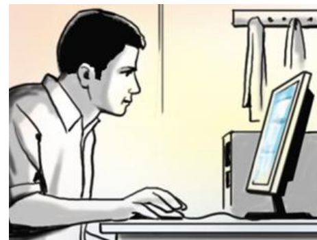
"Advertisers are not leveraging vernacular languages."

HYDERABAD: Advertising technology companies are coming up with strategies and products targeted at Internet users browsing in languages other than English and bundling them with analytics that will collect data on user preferences and measure reach.