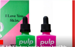
MARKETING Rana Daggubati, Anhill Ventures invest in skincare brand Pulp